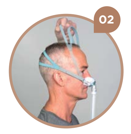
Step 2. Hold the mask frame in position with one hand and pull the headgear over your head with the other hand, positioning the straps above the ears as per the fitting image above.