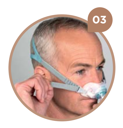
Step 3. Gently tighten or loosen the headgear straps on the sides of the headgear until you achieve a comfortable seal.