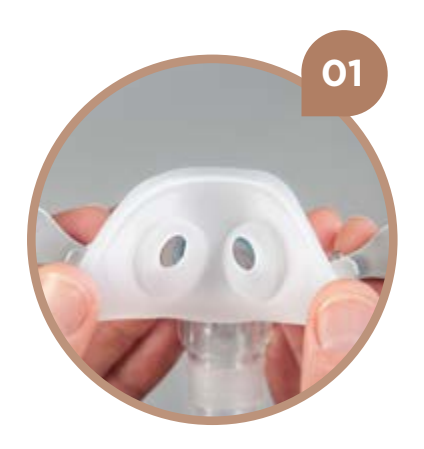
Step 1. Hold the silicone seal away from your nose and use your fingers to carefully spread open the soft side supports of the silicone seal and then guide the two openings into your nostrils.